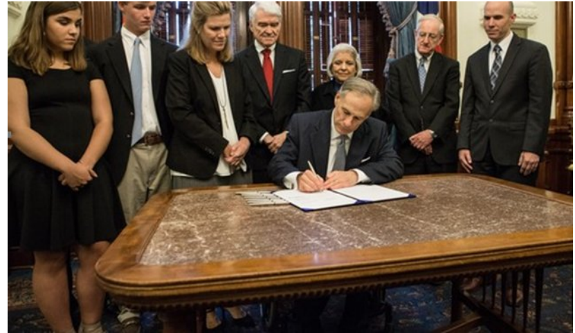
Gov. Abbott signs SB 42 into law May 27, 2017.